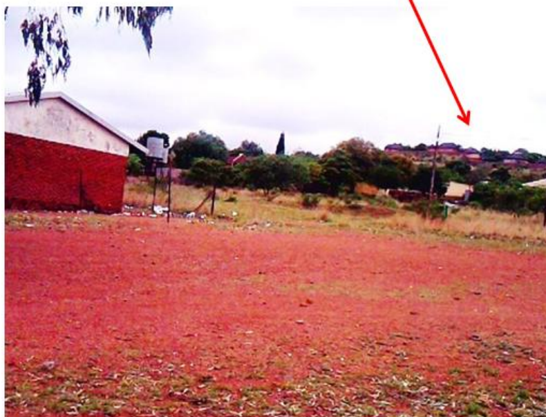
Figure 1: The school site in relation to the cultural village

In Figure 1 below, the thatched huts appearing on the top right hand corner are the structures at the cultural village.