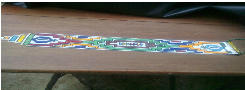
Figure 3: Ndebele beadings

All the three teachers reiterated that learners can use their mathematical knowledge to increase their participation at the cultural village. Also learners can create self-employment after school through designing Venda traditional materials applying their mathematical knowledge of shapes and transformations. Hence mathematical knowledge can be used to boost economic empowerment.